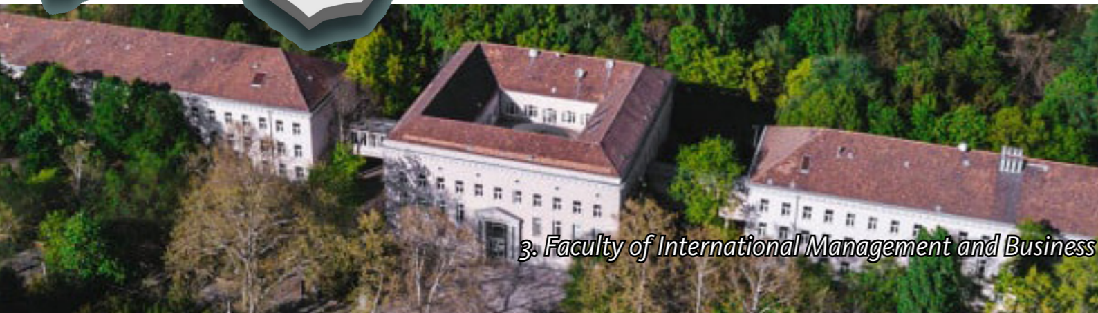
3. Faculty of International Management and Business