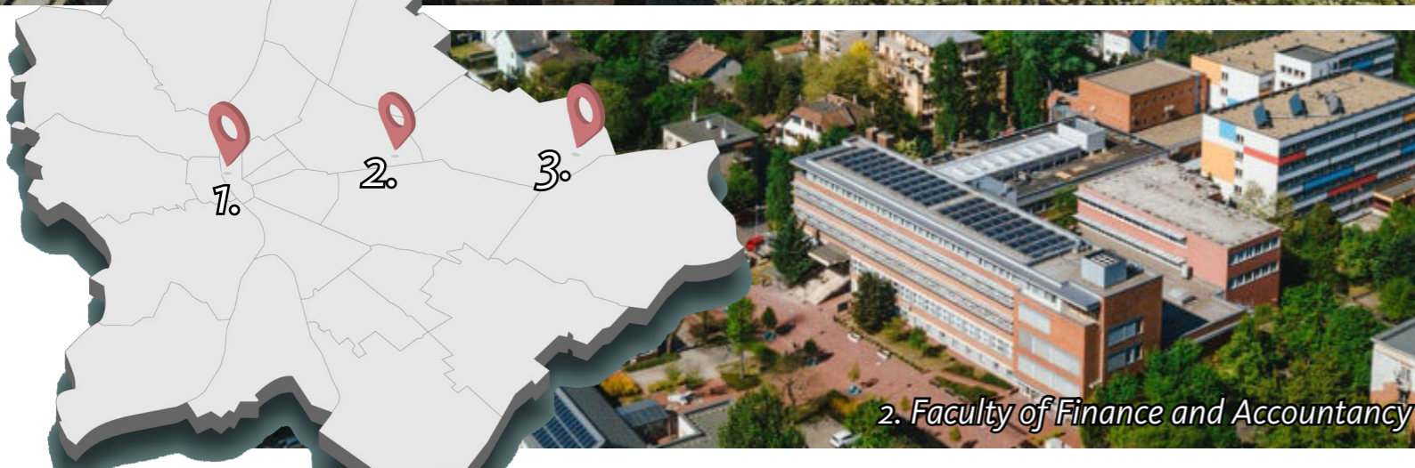
2. Faculty of Finance and Accountancy