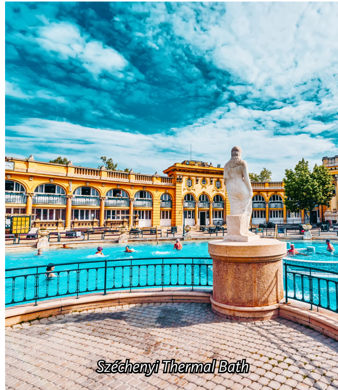
Széchenyi Thermal Bath