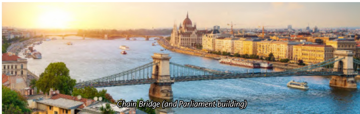
Chain Bridge (and Parliament building)

For more information check our page for incoming student